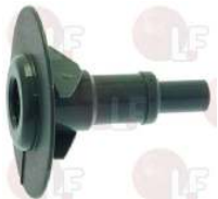
1095066 WATER COUPLING overall height 43 mm - \varnothing hose-end fitting 7 mm