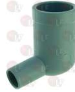
1095069 LARGE OUTLET FITTING hose end fitting \varnothing 9 mm