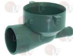
1095043 POWDER FUNNEL