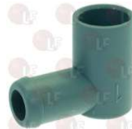
1095067 SMALL OUTLET FITTING hose end fitting \varnothing 10 mm