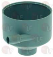
1095038 MIXER FUNNEL external \varnothing 62 mm - overall height 57 mm