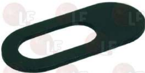
1095065 POWDER FUNNEL GASKET max. overall size 58x27 mm