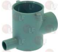
1095044 FUNNEL HOLE \varnothing 12 mm