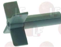
1095068 MIXER FAN BLADE 10 mm length 40 mm