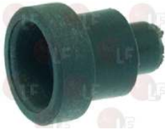
1095053 LOCKING NUT FOR MOTOR MIXER